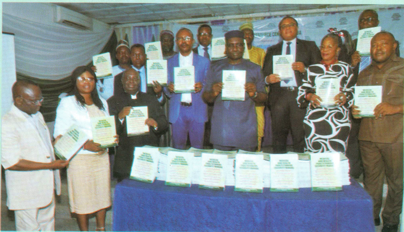
Public Presentation of the Manual. Nugget Hotel, Abuja. April 19, 2018.

The distribution of the Manual together with delivery of training to students of medical and health institutions are highly recommended as long term preventive security strategy to plant seeds of security culture which will germinate and take root as security consciousness as erstwhile students enter the ranks of professional medical and health practice.